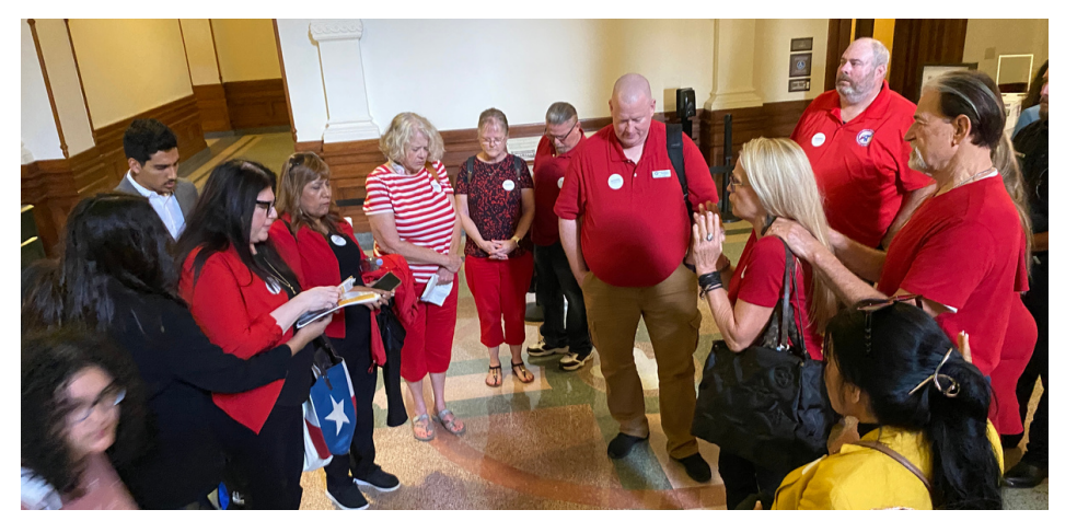
NSCA Representatives and fellow Chaplain Bill Supporters pray at the Texas State Capitol.